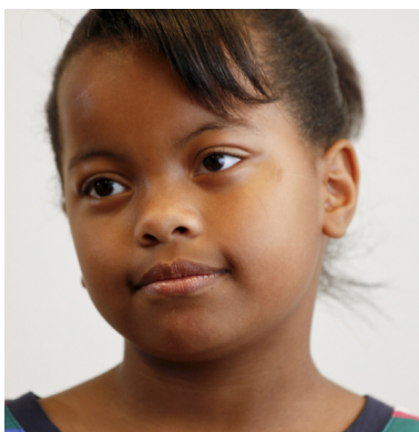
ACUTE LEUKEMIA TREATMENT