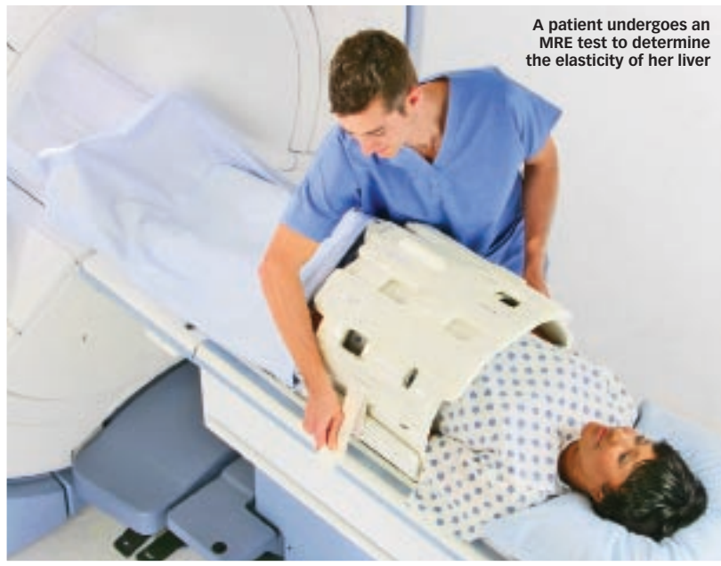
A patient undergoes an MRE test to determine the elasticity of her liver

One new device tells doctors how an organ or tissue would 'feel' if touched